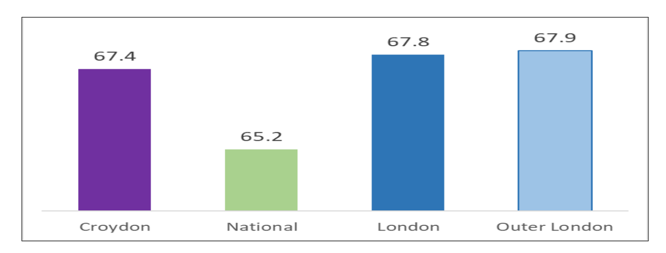
Table 2: % of children attaining GLD 2022 - Overall

4.2.8 There is a GLD gender gap in Croydon, 61% achievement of this measure by boys compared to 74% for girls. This is in line with all children nationally: